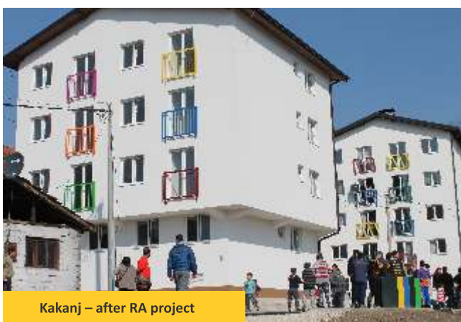
Kakanj – after RA project