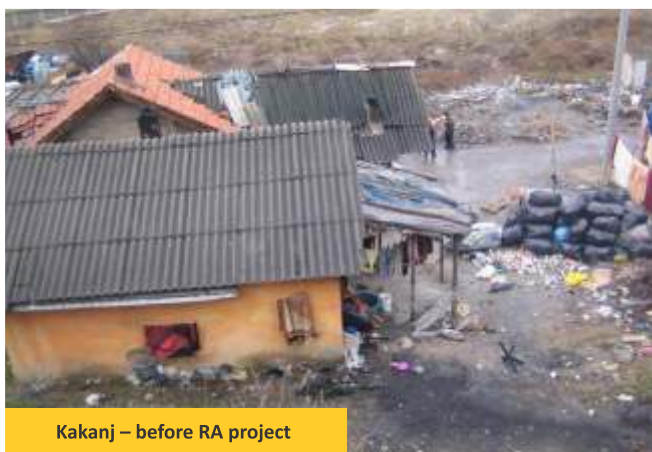
Kakanj – before RA project

Thanks to the EU funds and local co-financing 140 Roma families in 9 communities in BiH have significantly improved their lives. Key steps have been made, from the former homelessness to the current tenancy in a modern apartment through the social housing system, which is an excellent starting point for a decent inclusive social life.